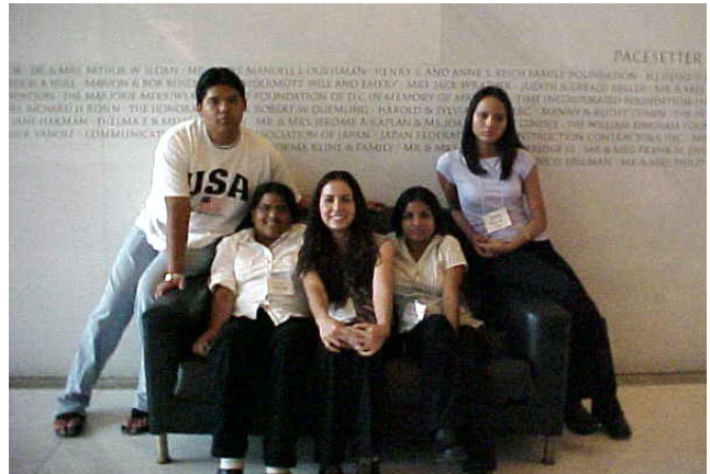
The Texas delegation experiences the EIDLDP's holistic learning setting, where they learn about other cultures and their histories. [pictured above: the Holocaust Museum, Washington, DC]

We thank you for taking time out of your busy schedules to listen to our issues and concerns. Please respond to our issues and proposed solutions in a timely manner.